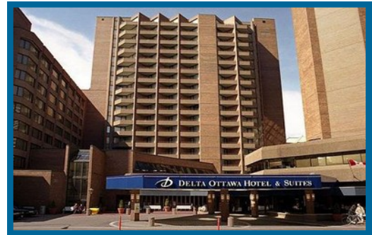
Delta Ottawa Hotel and Suites 350 Sparks Street

The office has a range of valuable business services that allow you to manage all of your meeting, administrative and project management requirements. Recent renovations, including technology upgrades, make the office a functional and professional place to conduct business. The main boardroom is spacious and accommodates up to 12 people. Office assistance is also available to ensure that your meeting runs smoothly.