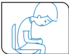
Diarrhea, nausea or vomiting