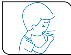
New or worsening cough