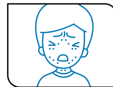
Skin changes or rash

2 If you have shortness of breath or difficulty breathing – call 9-1-1. If you answer YES to ANY of the questions above, please stay home and complete the COVID-19 Self-assessment online .