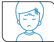
Fatigue or weakness