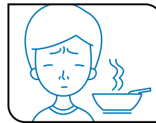
Loss of sense of smell or taste