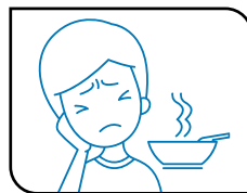
Loss of appetite