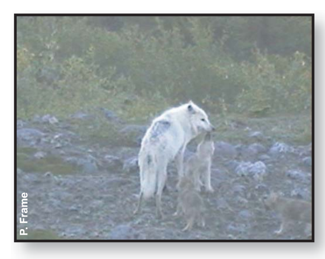
A pup solicits food from an adult.

allows an unobscured view of a wolf den from a distance. Remote observation can determine the various roles of the adults at the den and the number of pups present.