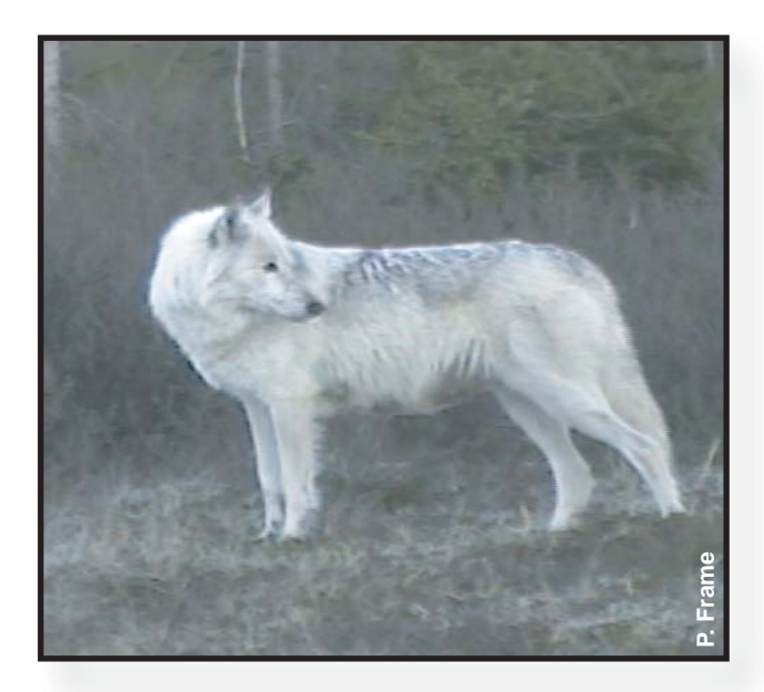
Nursing females are identified by evidence of pups suckling, as seen above.

Wolves are known for their high reproductive potential and this may be one of the contributing factors. We will look for multiple litters again when we observe dens next summer.