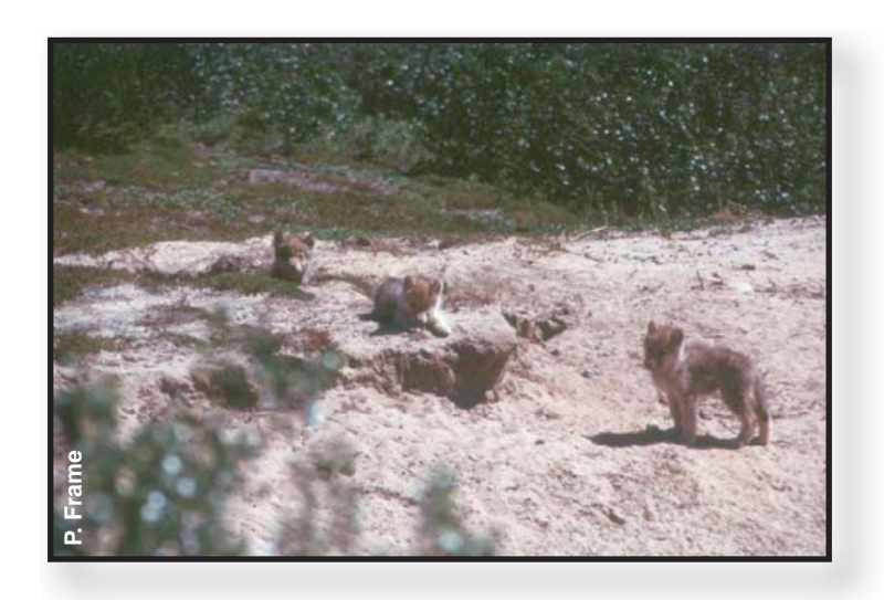
Pups at the Hilltop Lake den in late June.