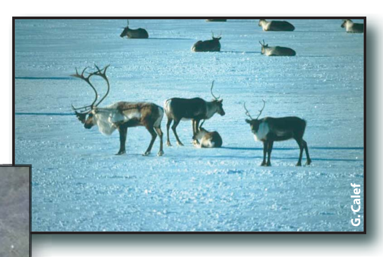
Caribou-wolf dynamics have a major impact on northern ecosystems.

This wolf collaring effort effectively doubled the annual sample size for mapping the distribution of the Bathurst caribou herd for those years because these wolves were captured on the Bathurst range. However, these satellite radio-collars previously deployed on wolves had a lifespan of only one year, were imprecise, and were optimized for summer data collection during denning. Therefore, data collected during winter were sparse.