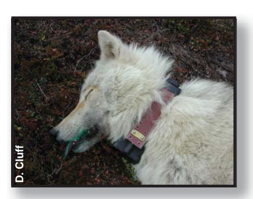
Wolf W385f captured and fitted with a GPS radio-collar.

We had planned to deploy the three GPS collars on wolves denning on the Ekati<sup>TM</sup> claim block in support of our wolf observations there. The caribou survey that BHP Billiton conducts each year would also provide important information on caribou presence to relate to wolf activity. However, wolves were only at one den at the time of capture so we could only deploy one GPS collar at Ekati<sup>TM</sup>. We did not find other wolves nearby, so we deployed the other two remaining GPS collars in the Snap Lake area to address our study questions there.