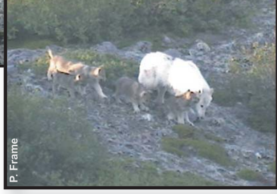
Top left: Adult male watches over the Box Lake den area. Above: Adult female and pups at Hilltop Lake den.

The average distance of the observation points from the den was 695 meters. Wolves were observed at dens near DeBeers Snap Lake Diamond Project (4 dens), BHP-Billiton Ekati<sup>TM</sup> Diamond Mine (2 dens) and Aylmer Lake Lodge (2 dens). We watched a total of 28 adults and 40 pups at these 8 dens.