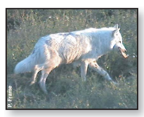
An adult brings food back to the den.

We visited 13 active den sites in 2002 and counted 44 adult wolves and 64 pups. Therefore, we calculated an average of 3.4 adults and 4.9 pups per den this year. Keep in mind that these counts are conservative because they are often done from an airplane and occasionally some pups may not be seen. Good ground observations tend to overcome this problem, but doing so takes time, and counts at all sites might take two months to complete. At right is the list of active wolf dens where we looked for pups.