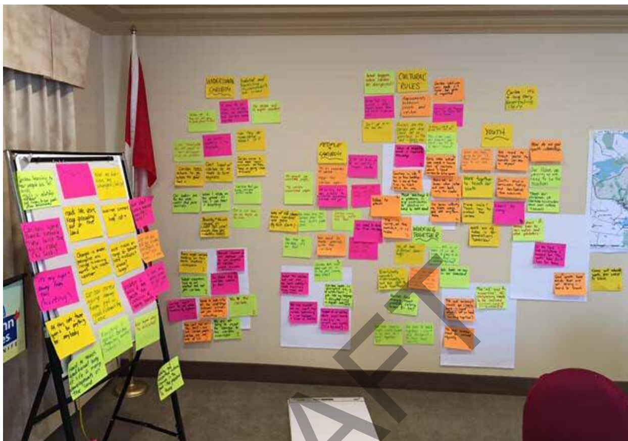
Figure 1 Key points, observations, themes and recommendations were showcased on the walls during the workshop to form an evolving record

The workshop was audio-recorded and transcribed nightly. Verbatim transcripts were critical to “getting the words right,” which is important given a legacy of Aboriginal peoples feeling that their words have been misconstrued or appropriated. With quality simultaneous notes, it was possible to present a list of preliminary recommendations, observations, and other key findings for participant comment on the final day of the workshop (Appendix B).