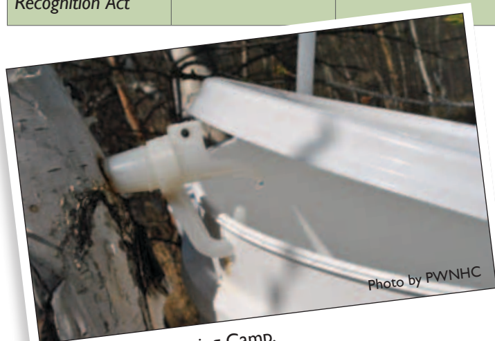
Birch Syrup Harvesting Camp.