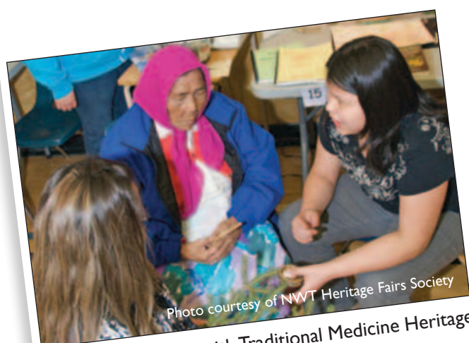
Behchoko students with Traditional Medicine Heritage Fairs Project.