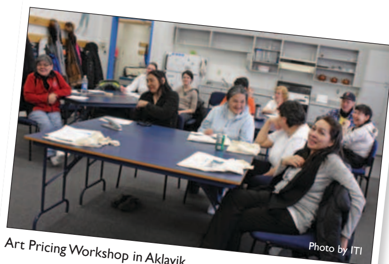
Art Pricing Workshop in Aklavik.