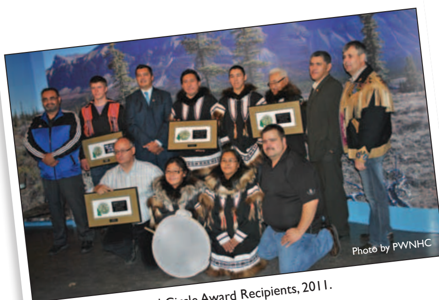
ECE Minister's Cultural Circle Award Recipients, 2011.