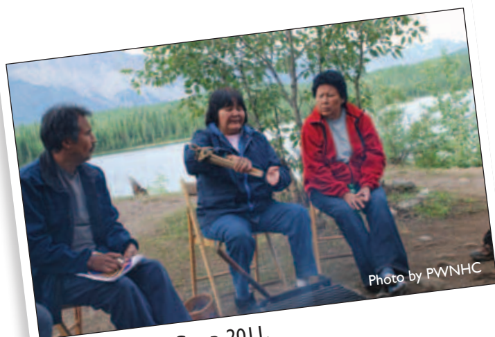
Ecology Culture Camp, 2011.