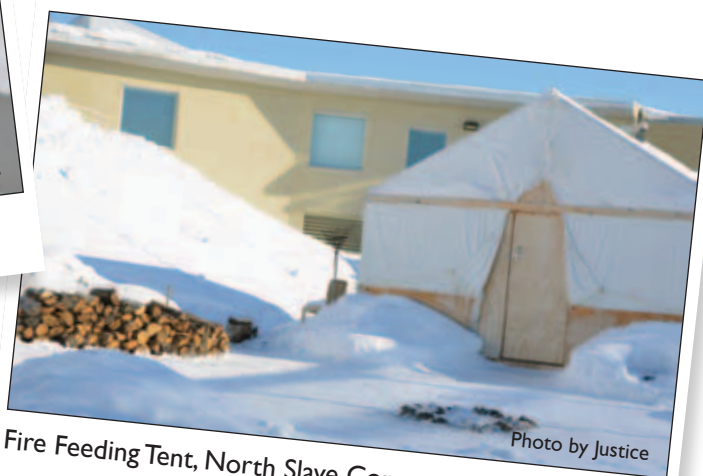
Fire Feeding Tent, North Slave Correctional Centre.