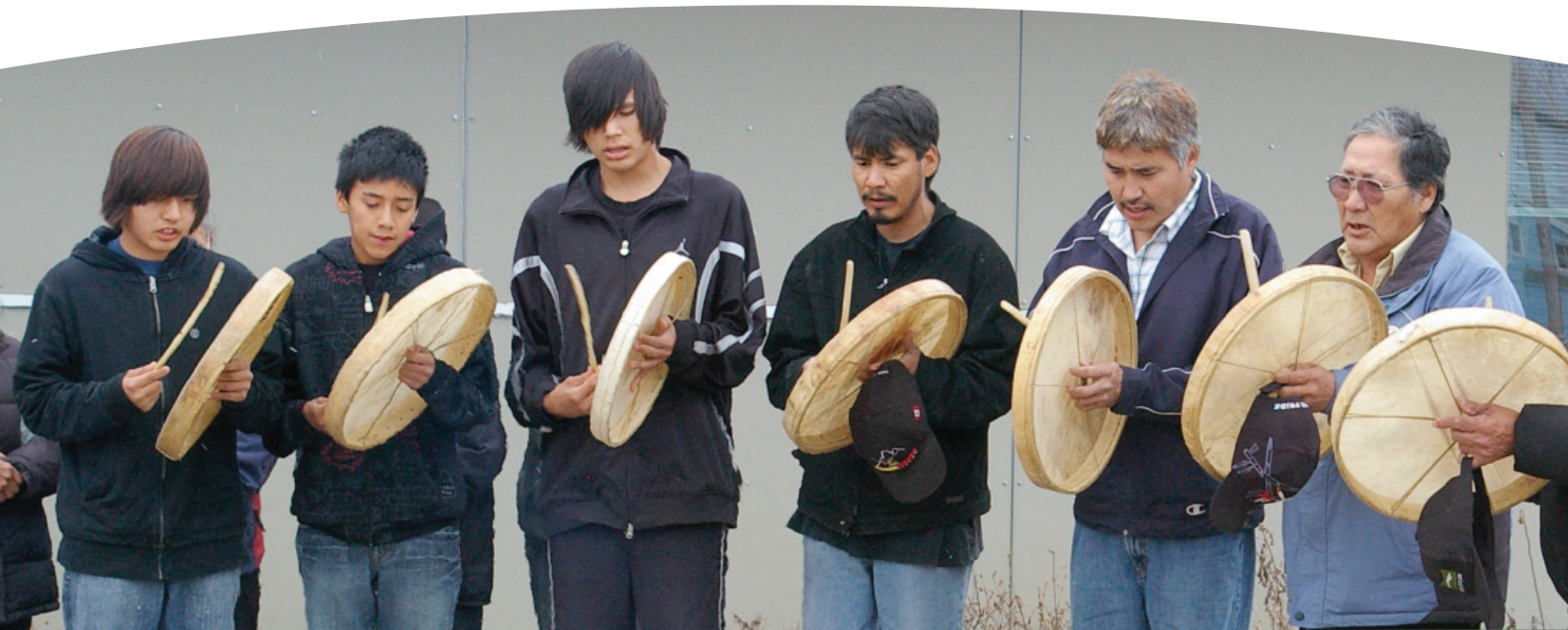
Dene drummers in Fort Smith.

A framework for a government-wide Cross Cultural Training Program was also approved. The framework sets out the GNWT’s desire to increase Aboriginal cultural awareness and diversity awareness in the workforce. A Cross Cultural Awareness Program will be developed in 2010-2011 and will have a number of components including on-the-land traditional knowledge education opportunities for GNWT employees.