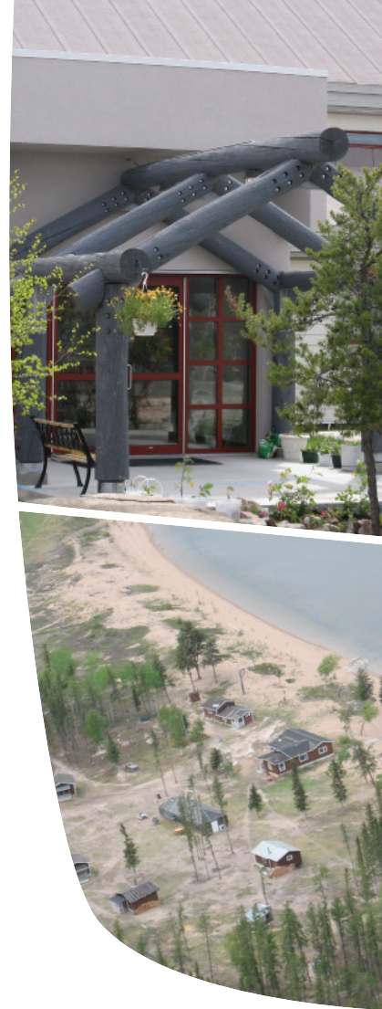
(Top) The North Slave Youth Offender Facility. (Bottom) The Justice Department offers wilderness camp experience to help offenders rehabilitate and reconnect with their culture.

The Correctional Northern Recruitment Training Program, provided to all new correctional staff, includes a section on cultural awareness and diversity. The traditional liaison officers, or an elder from the community, will discuss traditional values and knowledge with recruits. New staff are oriented to the traditional programming used in their facility.