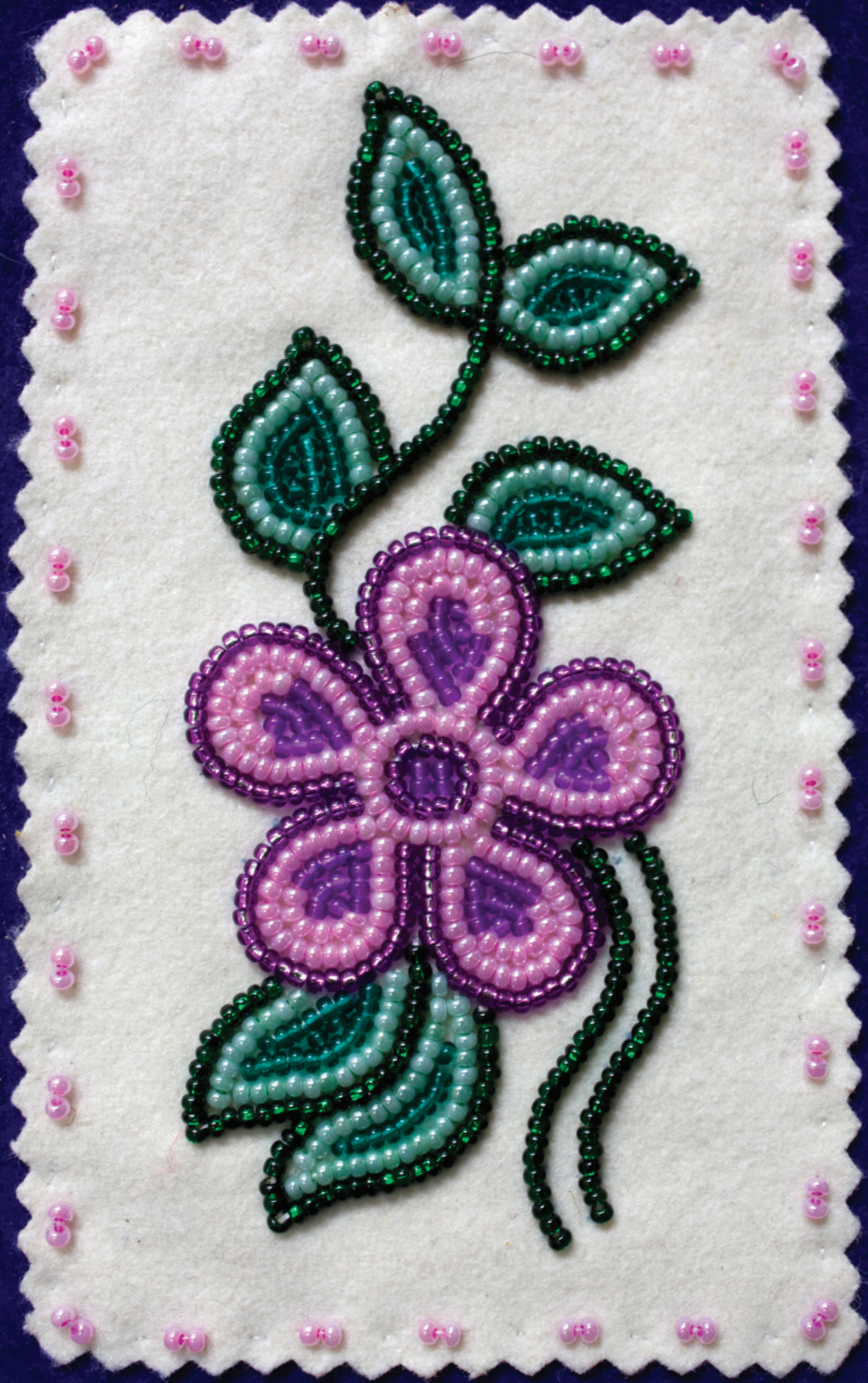
Traditional beadwork.