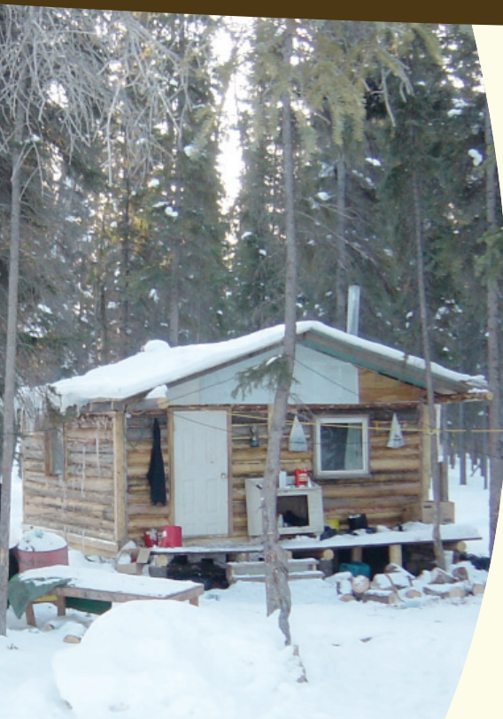
Once screened and approved, some offenders can spend part of their sentence at wilderness camps like this one near Fort Good Hope.

Wilderness camps in the NWT Corrections system were first established more than 10 years ago as a way for offenders to reconnect with their Aboriginal heritage, reflect and hopefully heal. In some cases, after the initial observation and screening period, entire sentences are spent on the land.