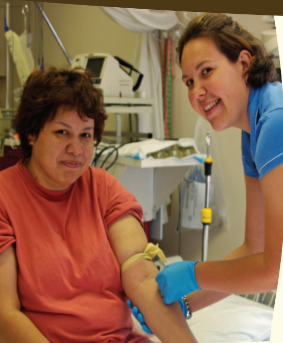
A nurse draws some blood from a patient.

The Dene Nation, the Dehcho Health and Social Services Authority and DHSS are working together to develop a service model to deliver traditional healing services within the Dehcho.