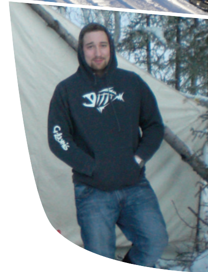
(Top) Students take part in the ENR Technology Program.