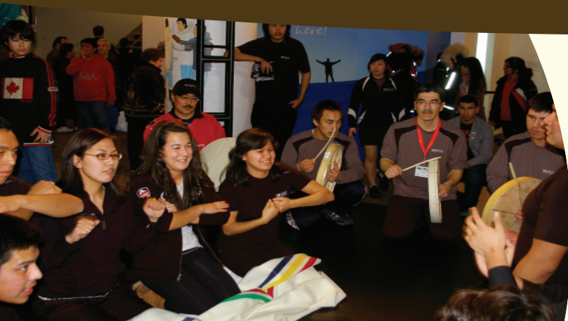
Dene Hand Games at Canada's Northern House during the Vancouver 2010 Olympic and Paralympic Winter Games.

Inuit and Dene Games demonstrate the strength of Aboriginal culture and show traditional ways people used to have fun on the land. Today, the games are an important vehicle for transmitting these traditional values to the younger generations. MACA sponsored Inuit and Dene Games athletes to demonstrate their traditional sports as part of the Vancouver 2010 Olympics and Paralympic Winter Games Traditional Games Program. This program was organized through MACA, in partnership with the Northern Games Society and the Aboriginal Sport Circle of the NWT.