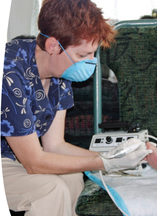
A home support worker provides foot care.

A Community Counselling Program Toolkit was developed to include standards, resources and ideas on incorporating traditional healing methods. “The Seasonal Circle of Northern Life: a Different Way of Living Guidelines and DVD” was created with help from Aboriginal groups. These tools are used for orientation and continuing development training for health care providers.