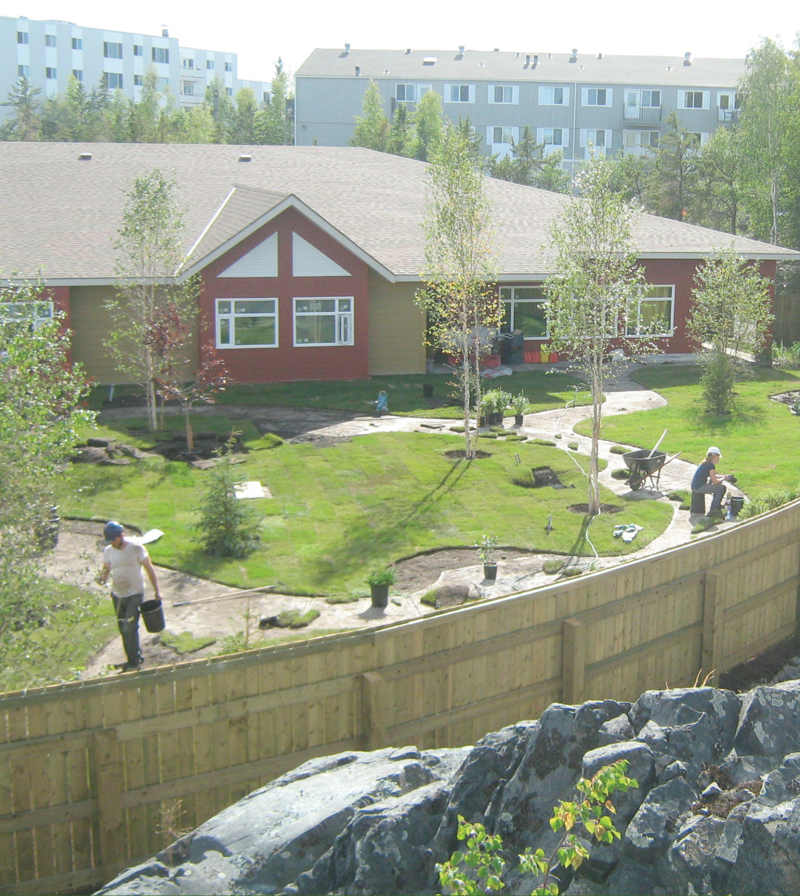
A look into the courtyard of the new Territorial Dementia Facility.