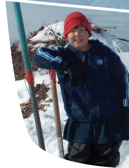
(Top) Inuvik region students build a snow cubby fox trapset during the Take a Kid Trapping Program.