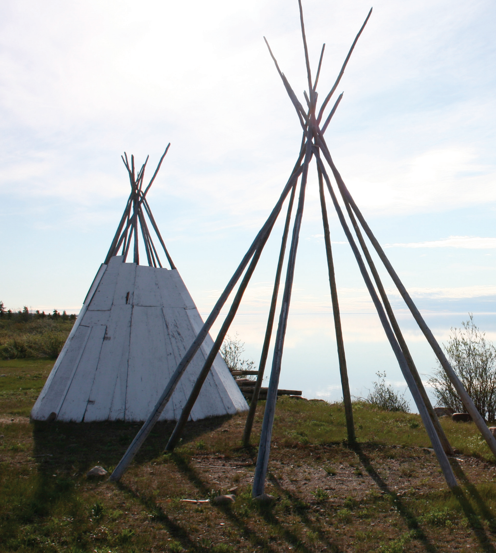
Teepees on the shore of Great Bear Lake in Délı̨nę.