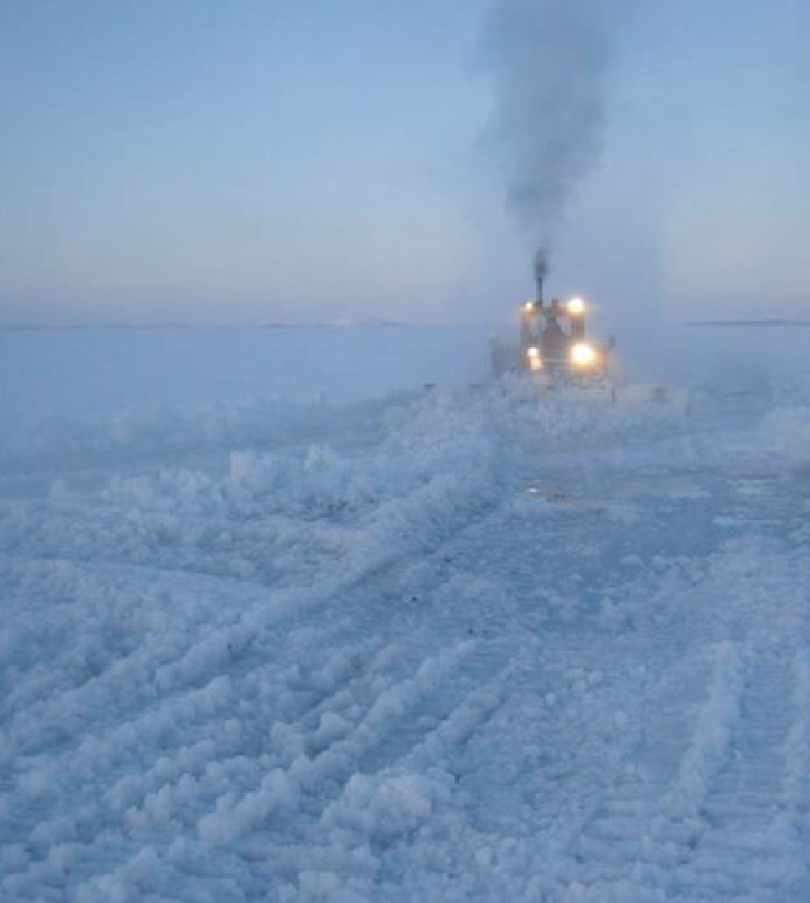
Crews work on the Marion Lake ice road in the Tłı̨chǫ region.