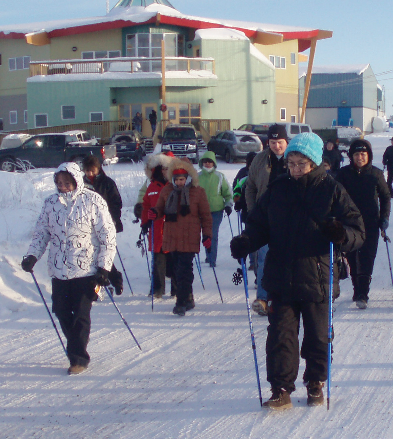
Elders from across the NWT learned how to keep active and fit during an Elders in Motion training gathering in Dettah.