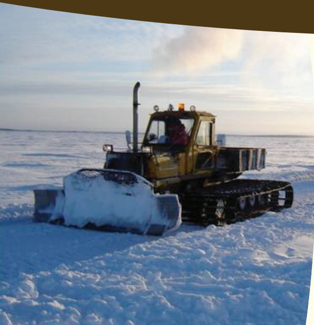
A plow puts the finishing touches to the ice road on Marion Lake.

When preparing for the winter road season along the Mackenzie River, the Department of Transportation (DOT) engaged community leaders in Fort Good Hope and Colville Lake to identify traditional knowledge holders in the area.