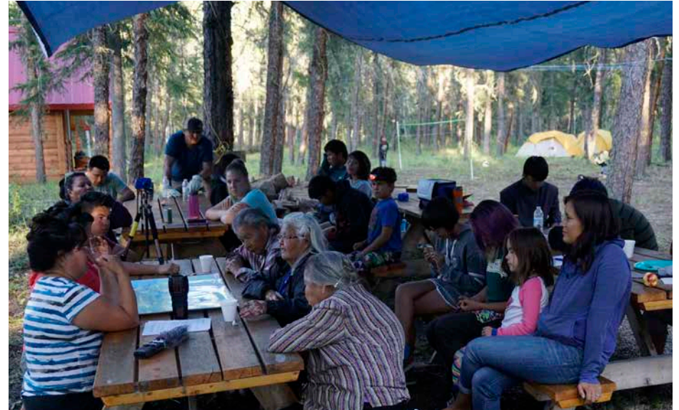
Mapping and sharing stories of important places on the landscape with Elders as part of a youth camp in Kakisa.

The Atlas provides a baseline for future monitoring initiatives to record how the land has changed over time. Identified community concerns included water levels and availability, land subsidence and slumping, land use from future and planned development, access to land and harvester safety.