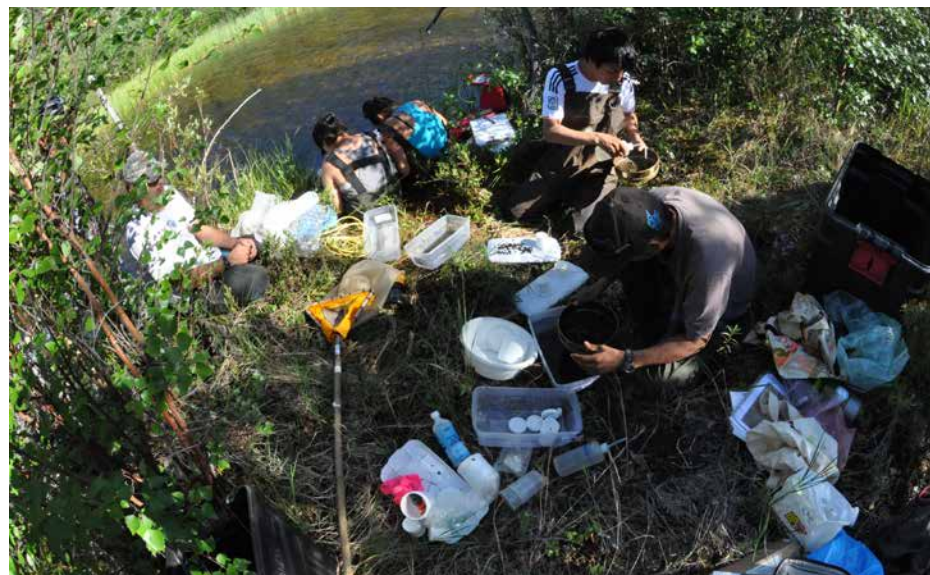
Local community monitors-in-training learning aquatic data collection methods.

Sediment cores collected from six lakes provided historical context and baseline information. Stream sediment and invertebrate samples showed varying concentrations of metals, demonstrating a broad range of natural variability. Measuring and characterizing the amount of disturbance currently on the landscape is still ongoing using remotely sensed imagery.