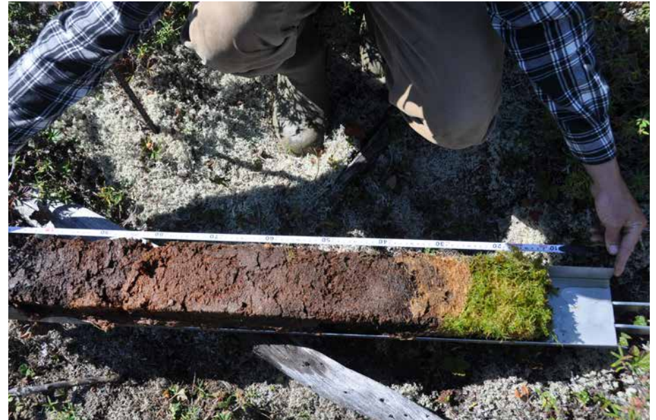
A peat core sample taken from a study site in the North Slave Region in 2016.

Project results show that concentrations of metals in water and sediment of the study lakes were below or near Canadian Council of Ministers of the Environment guidelines for the protection of aquatic life. Measurements in water and sediment from study lakes in close proximity to recent wildland fires did not show evidence of recent major increases in metal concentrations. A large dataset was generated during the project and data analysis is ongoing to further evaluate metal accumulation in lakes and peatlands in relation to wildland fire events.