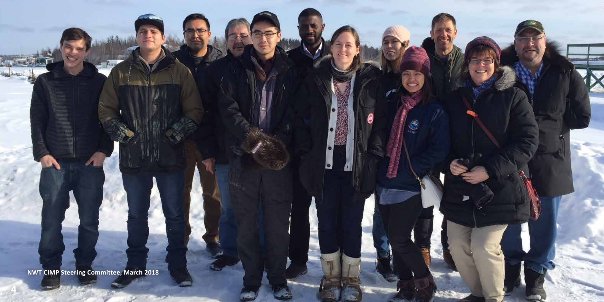
NWT CIMP Steering Committee, March 2018