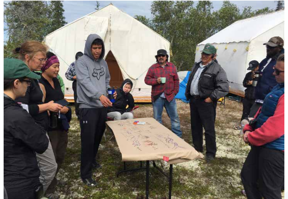
Participants at an environmental management workshop.

The following are examples of how the results of five NWT CIMP-funded projects were used this year to help make effective decisions about the environment.