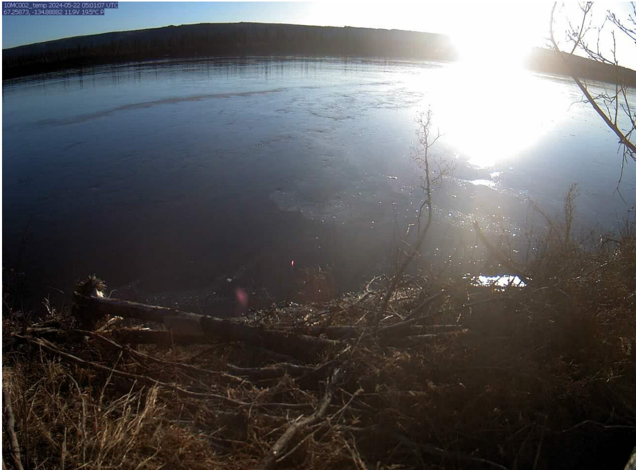
Above – Peel River above Fort McPherson hydrometric gauge photo from May 21 st at 23:00.

Note: Water level data are not currently being transmitted from this station. Photos from the hydrometric gauge indicate that water levels have dropped significantly since the weekend.